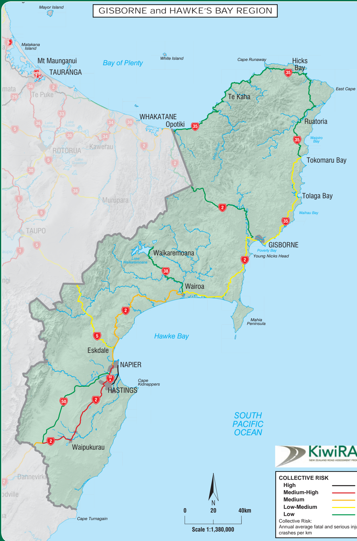
COLLECTIVE RISK MAP