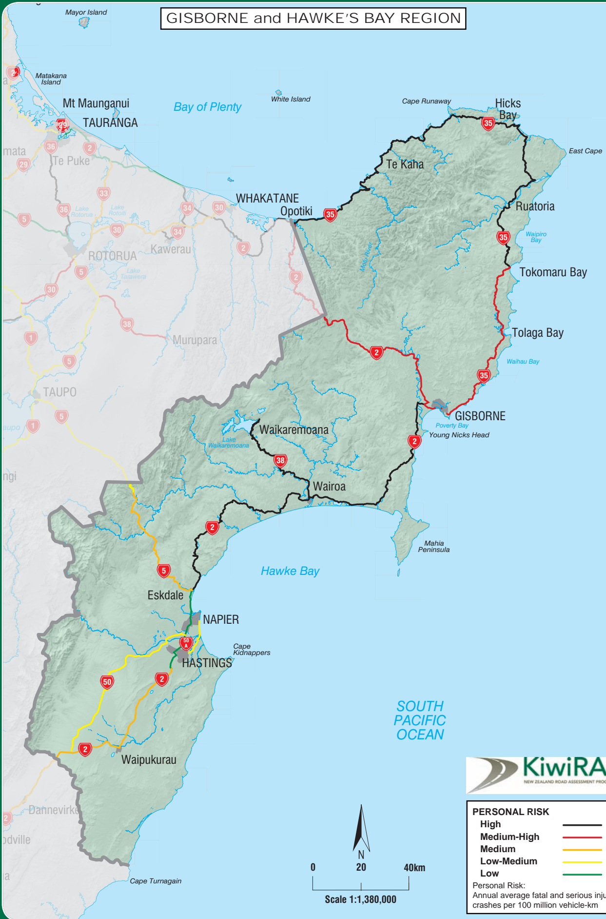
PERSONAL RISK MAP